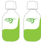
Two bottles of CLENPIQ (5.4 oz each)