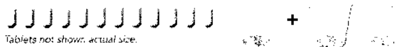
Tablets not shown actual size.

IMPORTANT: You must complete all SUTAB tablets and required water at least 4 hours before colonoscopy.